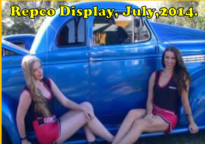
Repco Display, July, 2014.