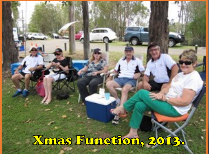
Xmas Function, 2013.