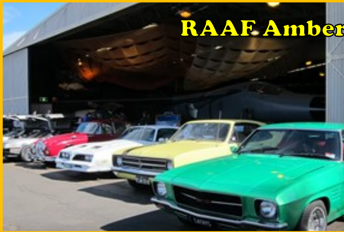
RAAF Amberley, July 2014.