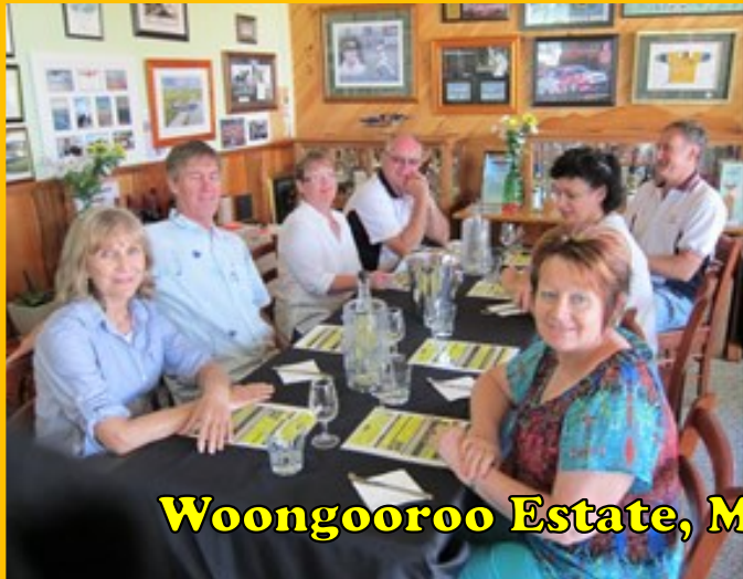
Woongooroo Estate, Mount Archer, May 2014.