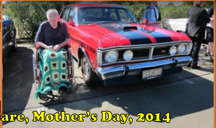
Regis Canning Aged Care, Mother's Day, 2014