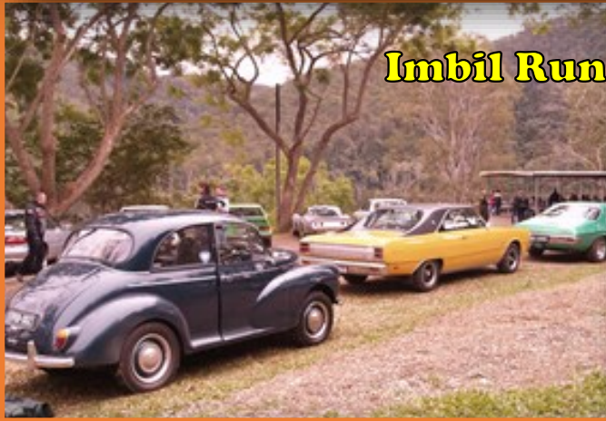
Imbil Run, July 2010.