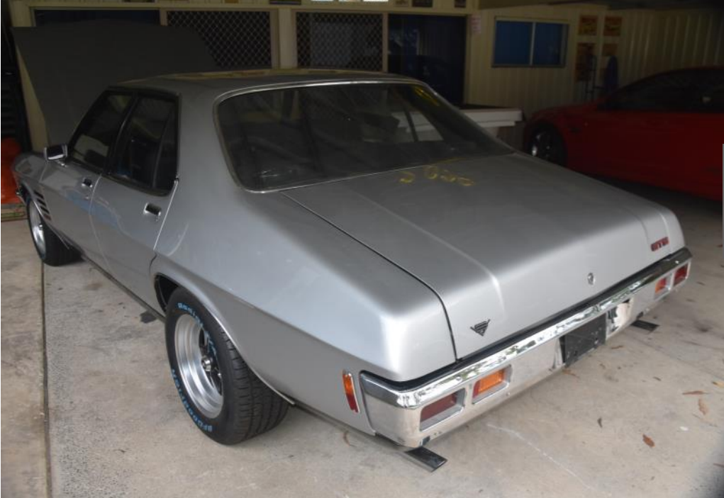
Jason's latest Monaro project nearing completion.