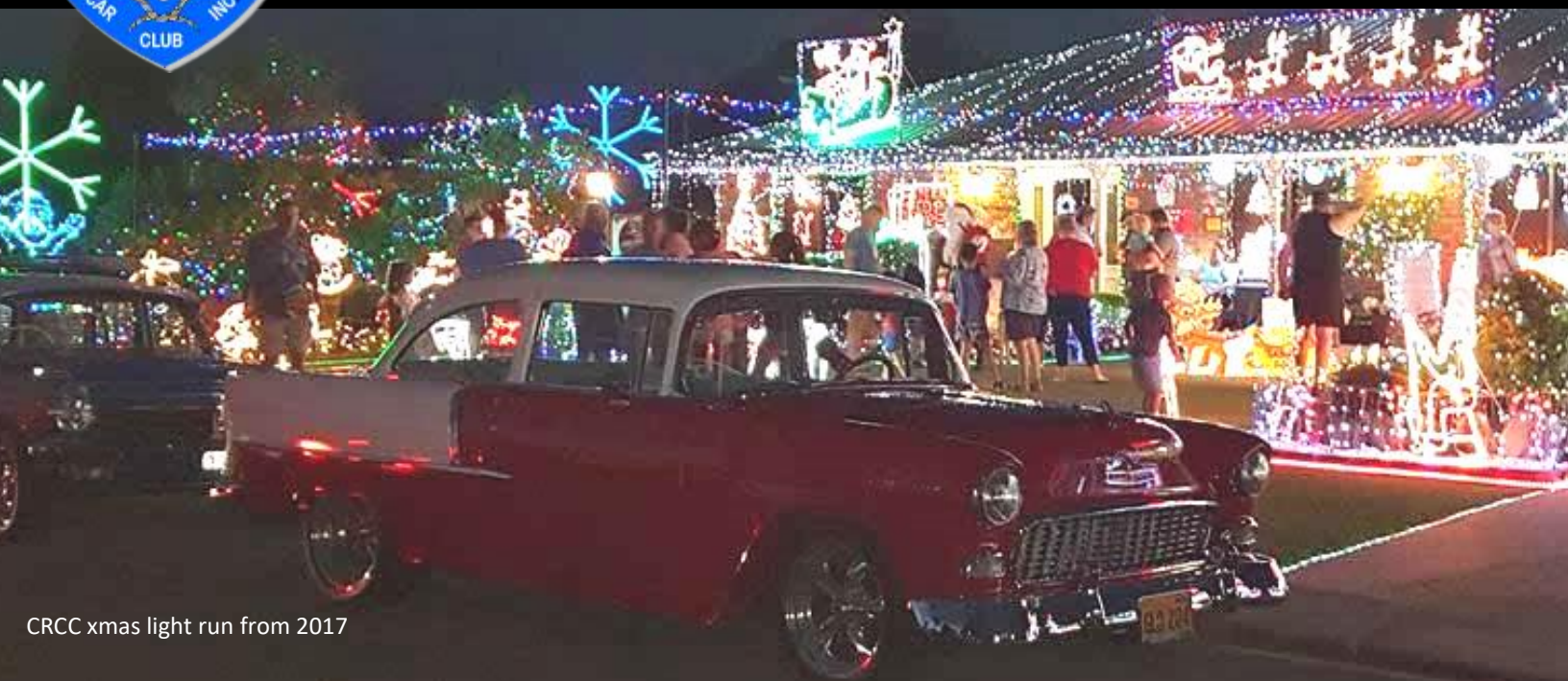
CRCC xmas light run from 2017