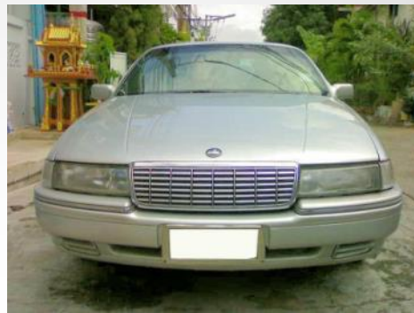
Caprice Front End on Calais