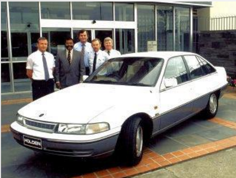
VP Calais as Designed