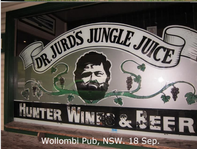
Wollombi Pub, NSW. 18 Sep.