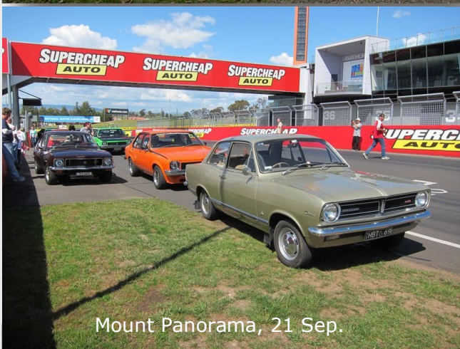
Mount Panorama, 21 Sep.