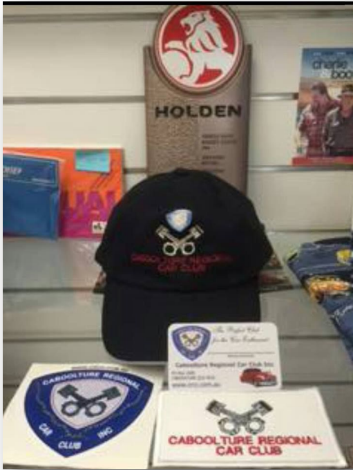
Club regalia on display at the National Holden Museum, Echuca, Victoria. Proudly donated by the Club.