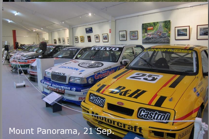
Mount Panorama, 21 Sep.