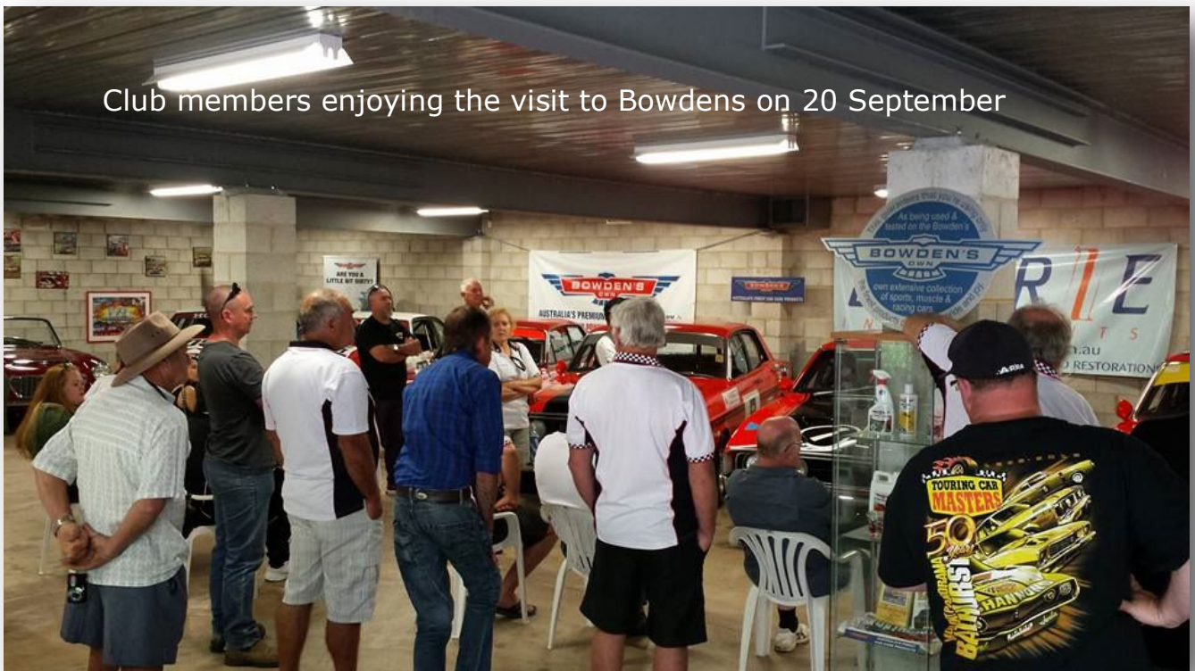
Club members enjoying the visit to Bowdens on 20 September