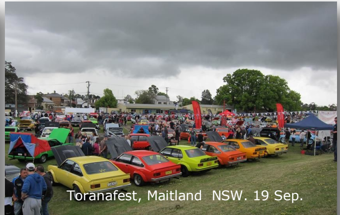
Toranafest, Maitland NSW. 19 Sep.