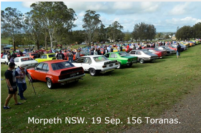
Morpeth NSW. 19 Sep. 156 Toranas.