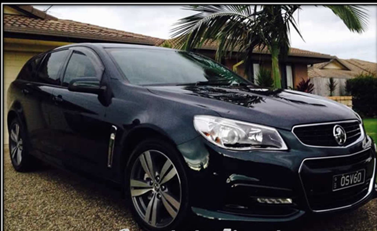
Car of the Month Claire Strickfuss ~ 2015 'Peacock' Holden SV6 Sportwagon