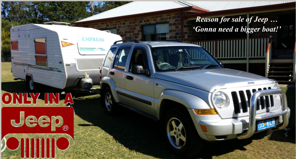
Reason for sale of Jeep ... 'Gonna need a bigger boat!'