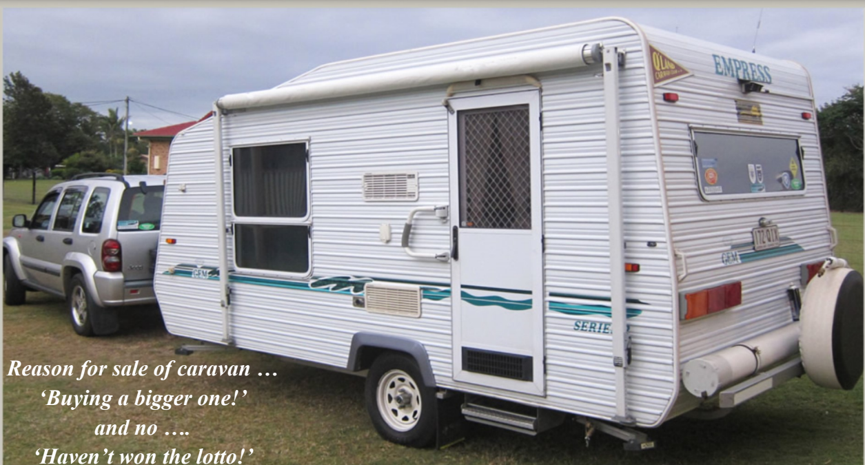
Reason for sale of caravan ... 'Buying a bigger one!' and no ... 'Haven't won the lotto!'