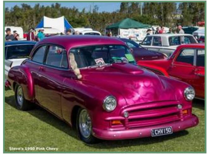
Steve's 1950 Pink Chevy