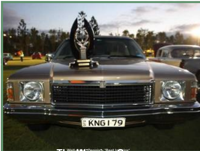
The Winning Car ...