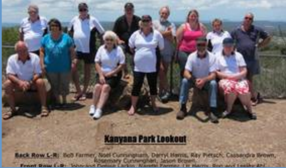
Kanyana Park Lookout