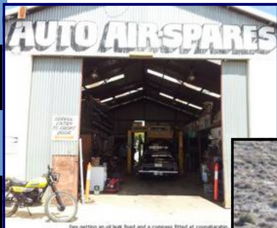
Broken-down in Coonabarabran.