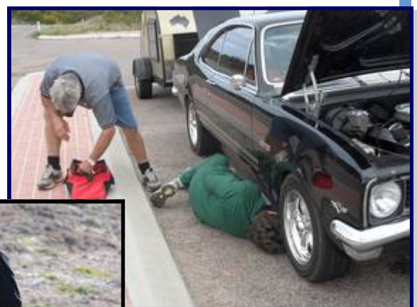
Just checking a few things!!