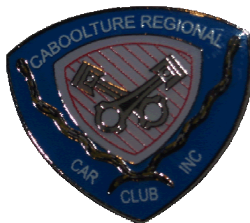
Lapel Pin, $5.00