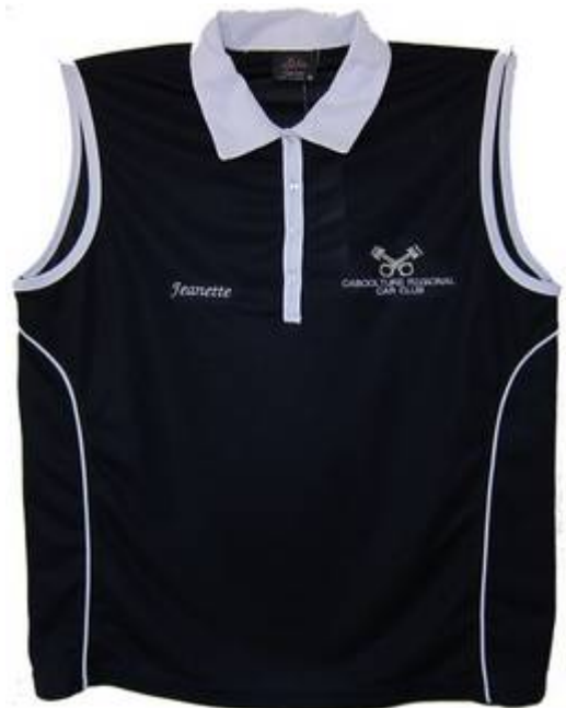
Ladies Singlet, $30.00