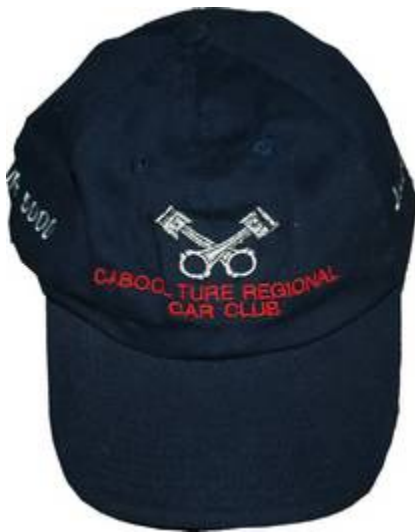
Baseball Cap, $15.00.