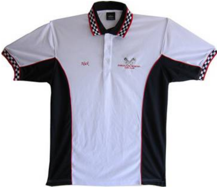
Polo Shirt, $30.00