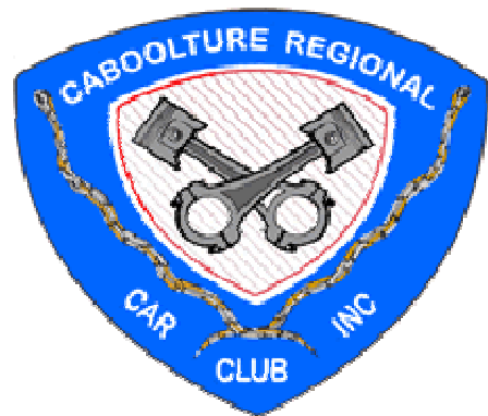
Car Decal (Free)